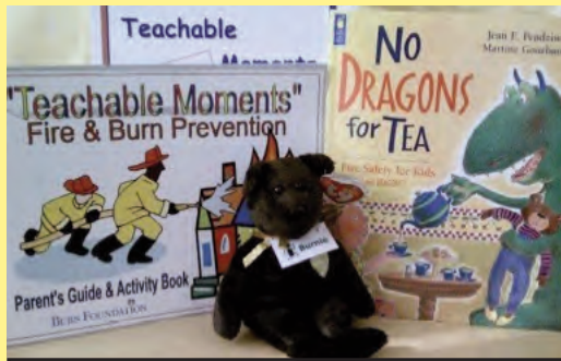
This year, every Philadelphia Head Start and Bright Futures classroom will receive our Teachable Moments program package (pictured).