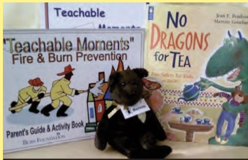
This year, every Philadelphia Head Start and Bright Futures classroom will receive our Teachable Moments program package (pictured).

We are proud to announce that, this school year, ALL Philadelphia Head Start and Bright Futures classrooms are using the Burn Foundation's Teachable Moments program to educate their students about fire and burn safety. Our program provides teachers with four interactive lesson plans; a read-aloud adventure storybook; a colorful poster for the classroom; and a "Burnie Bear" stuffed animal that children can use to practice the safety techniques they have learned. Each child will also receive our resource guide to share with their family. The Burn Foundation staff will continue to work directly with the programs through classroom visits and workshops for teachers, families, and service workers.